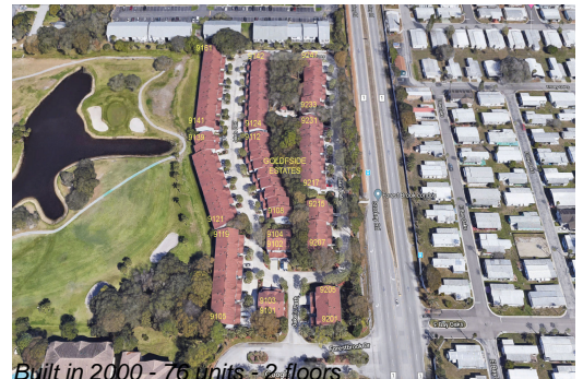
Built in 2000 - 76 units - 2 floors