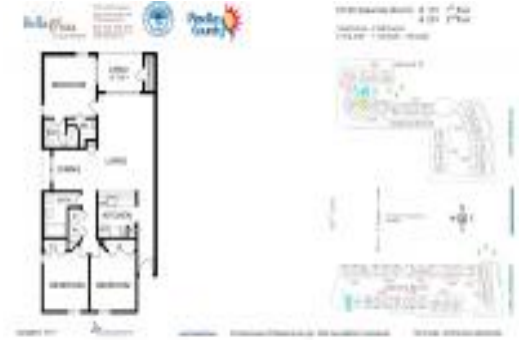
Built in 1987 - 192 units - 2 floors

The above valuated price is a baseline figure that does not take into account any specific renovation, upgrade, split, merge, or deterioration of the unit.