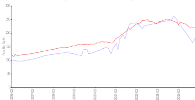
Town Shores of Gulfport - Jamison House vs Gulfport