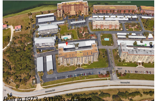
Built in 1973 - 93 units - 8 floors