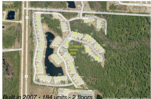
Built in 2007 - 184 units - 2 floors