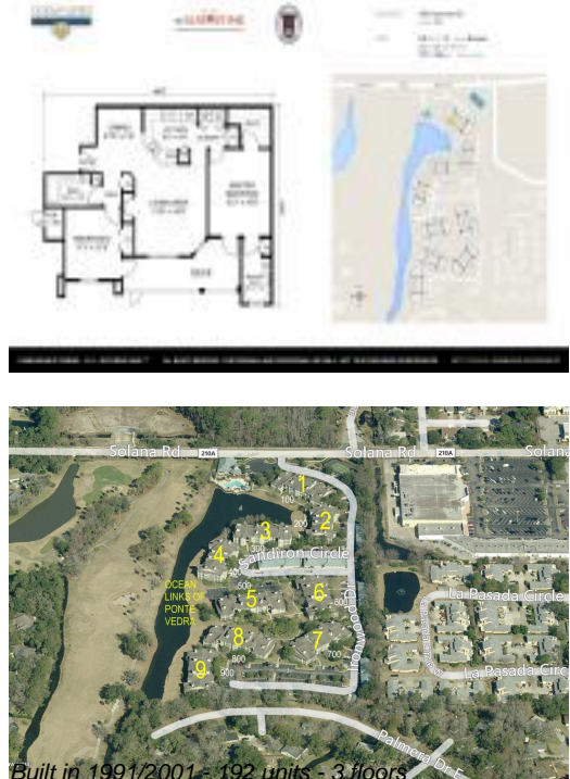
Built in 1991/2001 - 192 units - 3 floors