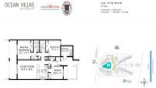
Map of Ocean Villas showing the location of Unit 90.