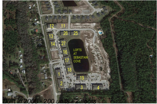
Built in 2008 - 200 units - 2 floors