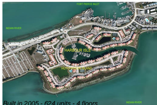
Built in 2005 - 624 units - 4 floors

The above valuated price is a baseline figure that does not take into account any specific renovation, upgrade, split, merge, or deterioration of the unit.